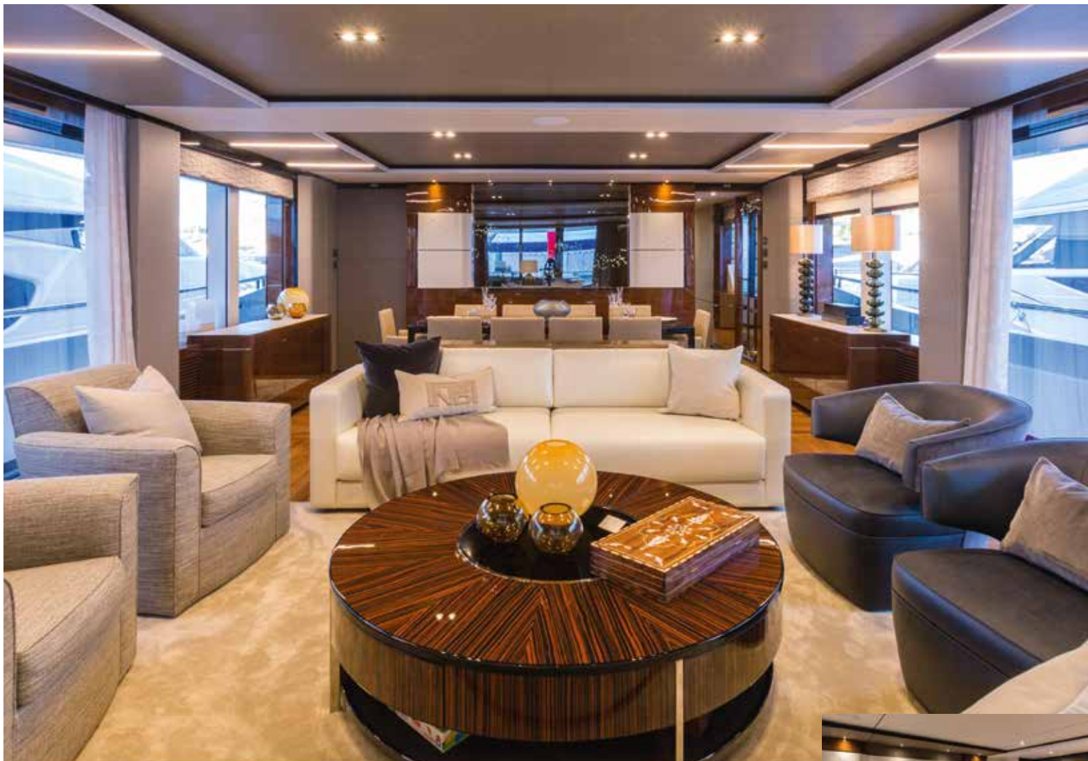
Above: natural light abounds in Antheya III's spacious main saloon, thanks to floor-to-ceiling windows. Left: the floating stairwell between main and lower decks is the biggest "wow" factor aboard, while the master suite (right) and main deck dining area (below) show off the panelling and textures of which Princess Yachts' director of creative design is particularly proud