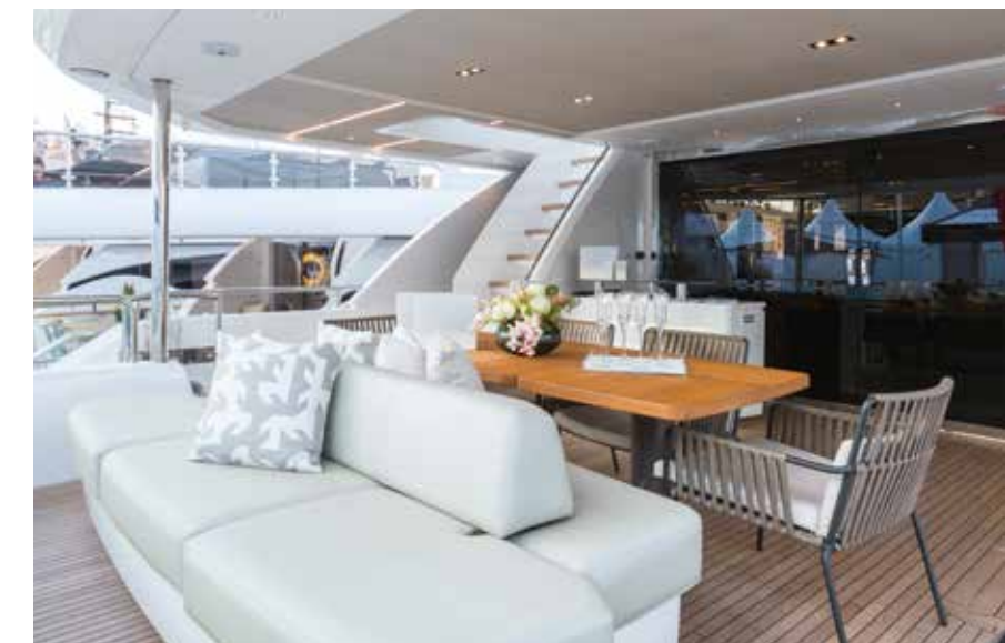
Above: the main deck aft offers not only alfresco dining but, unusually, aft-facing seating for a view over the transom. Right: the raised pilothouse looks out on the stunning foredeck lounge, while the hydraulic swimming platform, (below) brings the water into play whenever you want it